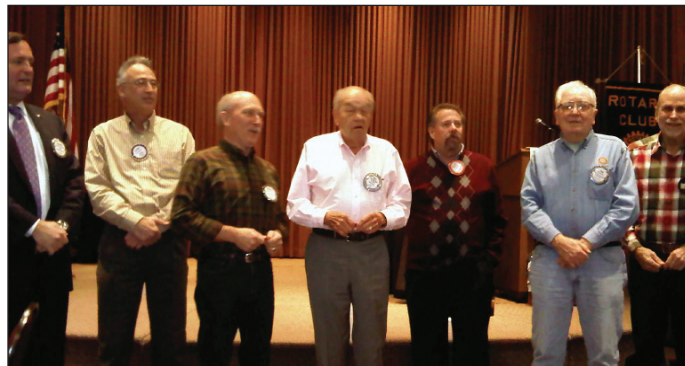
The December Birthday Boys