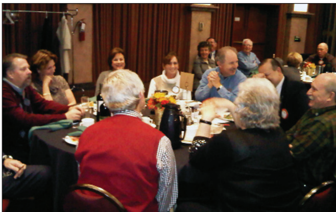
and.....the losing table!

To say there was a little competition would be an understatement with a total of eight tables competing for the cash prizes. At the end of 4 rounds, out of a total of 32 questions only 2 had been incorrect. The competition was fierce! It took 10 complete rounds to determine that the winner was table number 6, splitting 70 percent of the jackpot—$255. Tables number 5 and 8 tied for second place sharing $109 between them. A fun time was had by all.