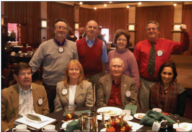
Here they are - the winning table!