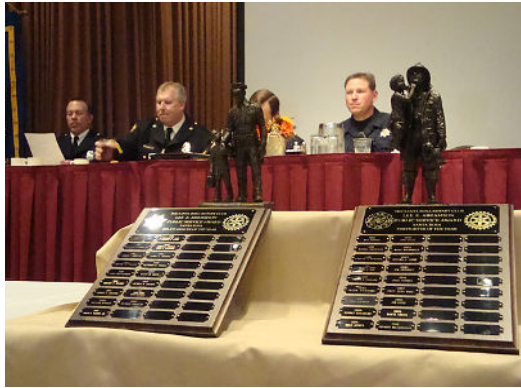
Public Safety Awards