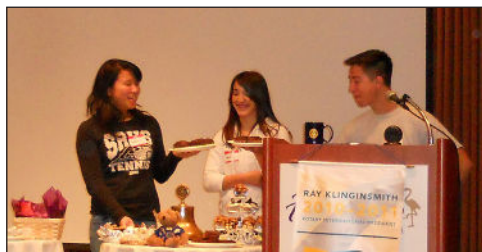
Santa Rosa High School Interact Club

The Interact Club of Santa Rosa High School brought their delicious cupcakes and