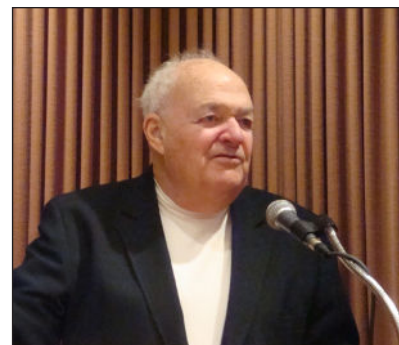
Speaker Thomas C. Reed