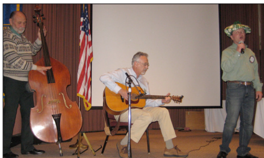
A trio of Leprechauns