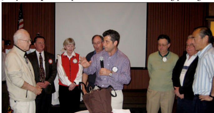
March Birthday Madness!