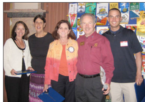
The June birthday celebrants