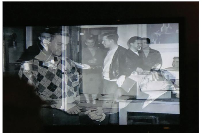
Collage of a young John Brown