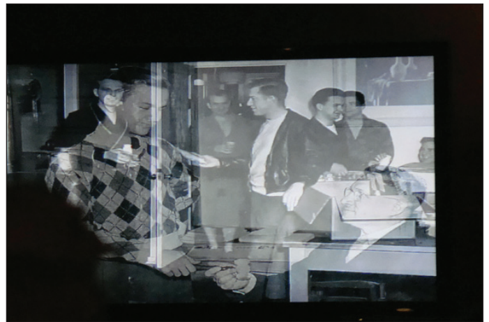
Collage of a young John Brown