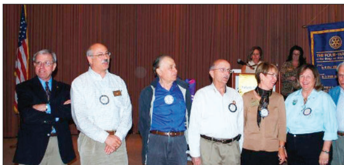
Happy Birthday to the November babies