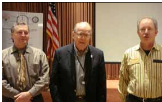
Three of the May Birthday Honorees