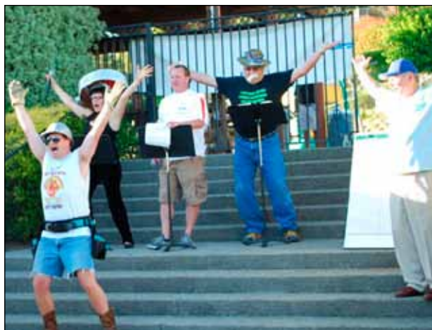
A rousing rendition of YMCA