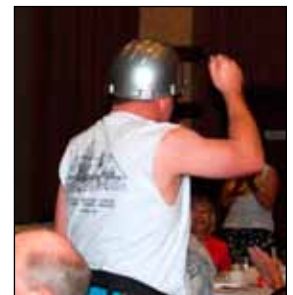
A dance so scandalous, we dare only show it from behind!