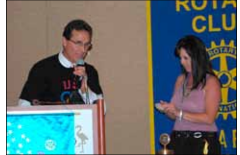
Past and Present Presidents exchange pins