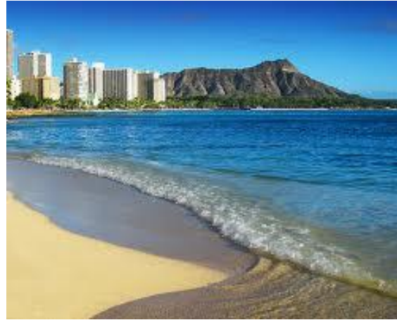
Diamond Head and Waikiki Beach