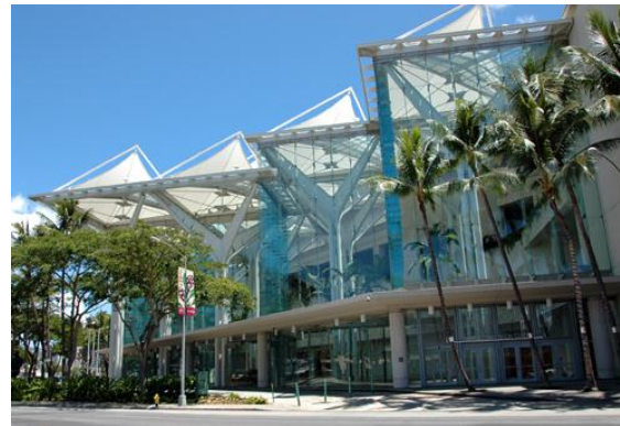
Hawaii Convention Center