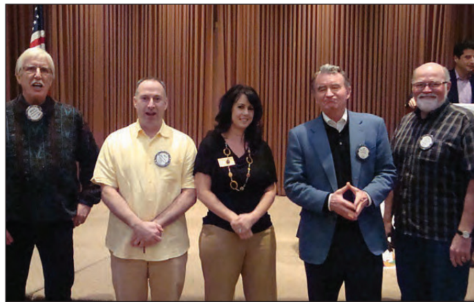
Five of the Fabulous January Birthday Folk