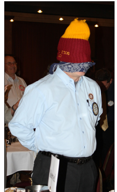
"The Donald" bound and gagged

The "HEAL: Northern California Santa Rosa Youth Evaluation" provided funding to expand efforts in northern California to include two additional major secondary schools in Santa Rosa as part of the Healthy Eating Active Living (HEAL) youth evaluation. These two schools represented an important part of the youth population in the areas where the changes were being made.