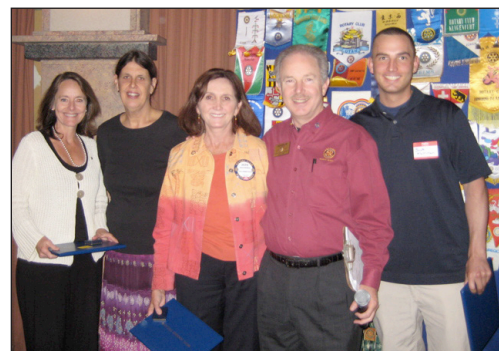
The June birthday celebrants