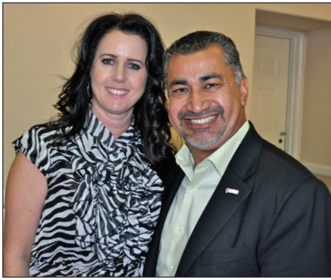
President Marnie and Mayor Olivares

better. To achieve this, the City has formed a task force comprised of a number of different constituencies within the City to analyze and suggest actions to increase the City's and its resident's and businesses' economic competitiveness, and he outlined various goals in order to achieve a strong, sustainable economic base for the City and its residents. The City wants to streamline its own operations in order to get out of the way and let progress happen. The task force is an example of getting all the residents and businesses to work together in order to get the City out of the current economic hole.