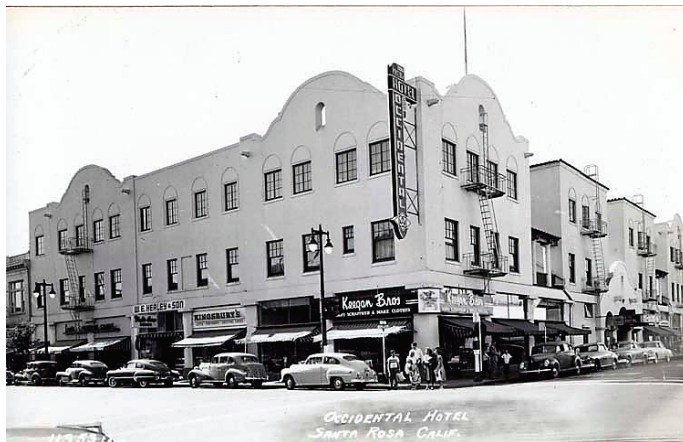
Santa Rosa's Occidental Hotel where our club's first meeting was held 90 years ago

No Meeting Wednesday, November 23rd Due to Thanksgiving