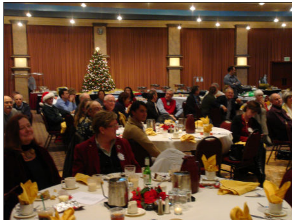
The crowd had a great time at the wrap party

A wonderful evening of food, family, fun and giving had by all! Happy Holidays everyone!