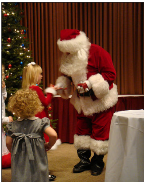
Santa was a hit with the kids

Tonight's program was to wrap presents for our annual Christmas ballet and gift-giving program. Before we got going on wrapping presents, a visit from Santa Claus pleased the youngsters in the crowd. Santa seemed to be a bit delayed. But in the end, he showed up and had some nice gifts for the little kids.