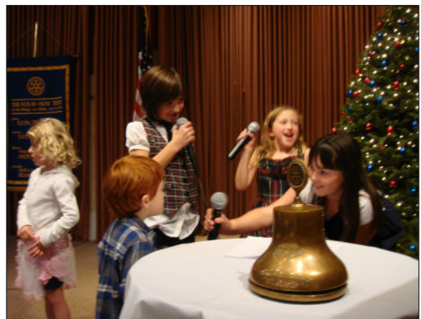
The kids had a great time around the tree

Pris Abercrombie had a knee replaced and is doing well.