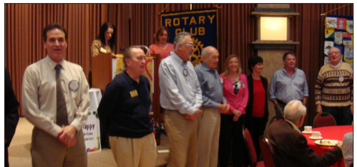
December Birthday Babes