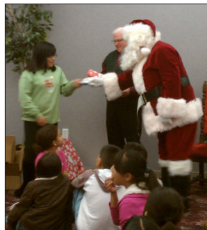
Santa gives the children a merry Christmas

The Nutcracker is two-act Russian ballet that premiered almost two centuries ago in St. Petersburg the week before Christmas. The