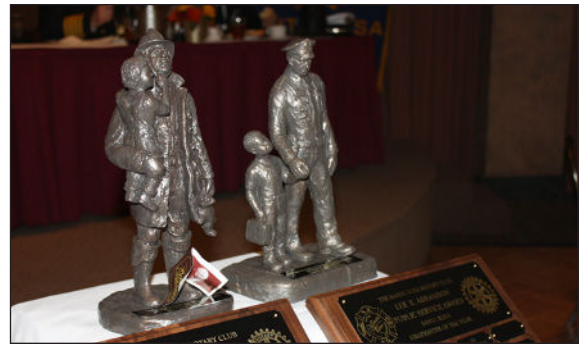
Public Safety Awards