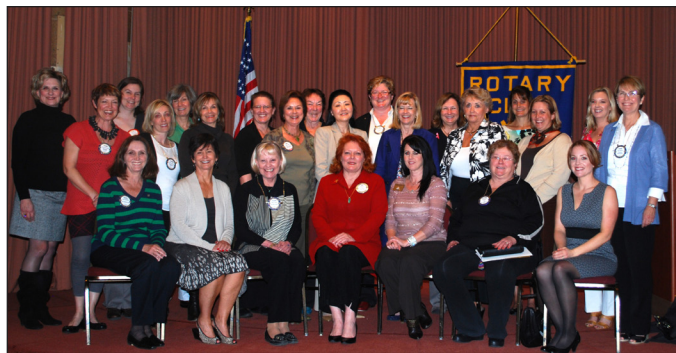
The Wonderful Women of Rotary!

The Columbia Disaster: After the Challenger fiasco, an independent consulting company recommended a change in culture at NASA, including firing the top three levels of management. That did not occur. Continuing with a philosophy that since no accident involving the breakage of plastic insulation from the central fuel tank during liftoff had not occurred, such breakage would not damage the wings of the shuttle and cause an accident. NASA refused to make design changes to fix that situation and/or incorporate a docking feature on the shuttle that would have allowed the shuttle to have linked up with the space station in case the shuttle did sustain damage during liftoff. NASA's culture of invincibility resulted in another fatal incident. Insulation did fall off during the launch and caused damage to heat sensors on a wing of the shuttle. Since the shuttle could not dock with the space station, it had to try to return to Earth. During reentry into the Earth's atmosphere the crew was unable to control the shuttle's flight path resulting in the break-up of the shuttle and its crash. Mike's conclusion: this was not an accident either.