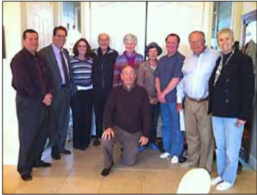
The World Community Service Team

Three other current projects are still under consideration: Our help with a water project in Uganda; Dental services for a village in Uganda; and an education project in India in cooperation with a Rotary Club in India,