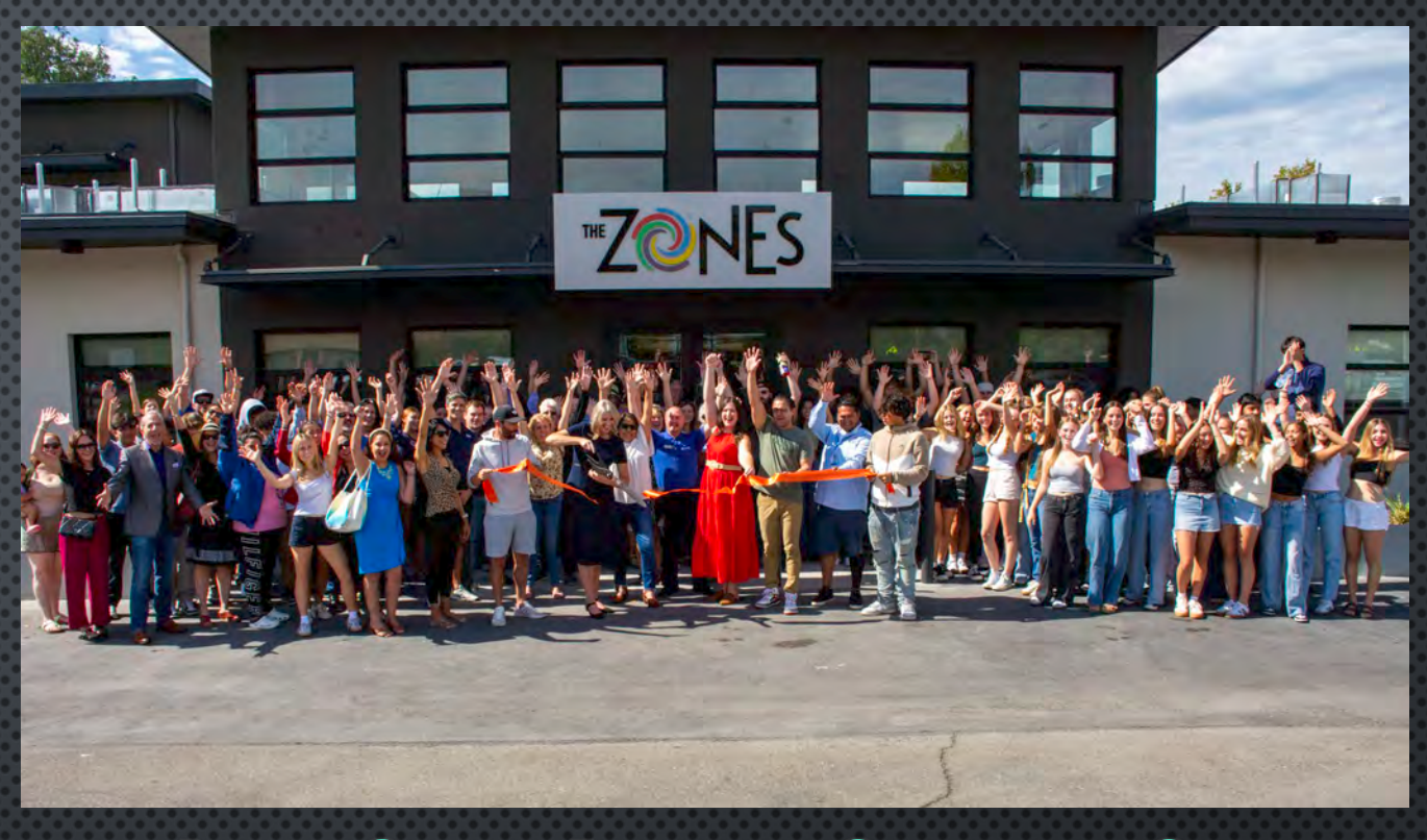
RIBBON CUTTING EVENT WITH CHAMBER OF COMMERCE OCT. 4, 2024